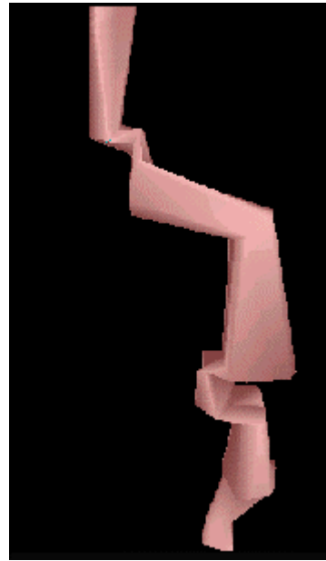
Figure 1 - Detail of Dowel Dale Side Pot, looking somewhat from above, with the scaffolded shaft on the right hand side.

cross sections was a pain in the neck. Intermediate cross sections along the tube connecting two survey stations were going to be necessary to avoid the prismatic look of the current output. The case we wanted to model was that of a passage snaking from side to side, but maintaining the same cross section.