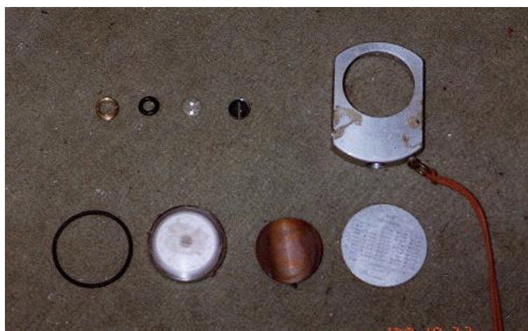
Figure 2 - The completely disassembled instrument. The top row is bush, O-ring, lens, sighting slot, body. The bottom row is O-ring, capsule, Spring-washer, Backplate