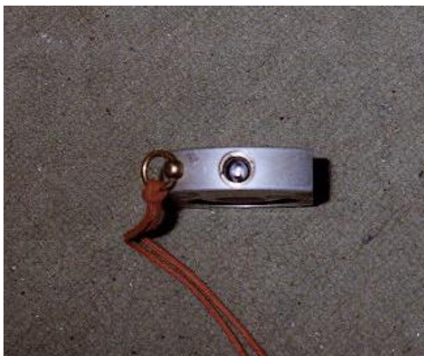
Figure 1 - The finished item, with the ring replaced by a removable bush.