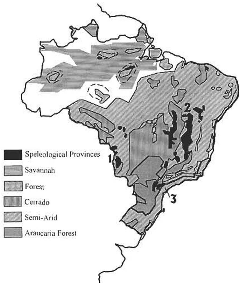
Fig. 2 - Past (between 13,000 and 18,000 years b.p.) morphoclimatic domains in Brazil (modified from Ab'Saber, 1977b). The Speleological Provinces (modified from Trajano & Sanchez, 1994) are placed in the same map. (1) = Bodoquena Ridge Speleological Province; (2) = Bambuí Speleological Province; (3) = Ribeira Valley Speleological Province.